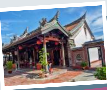
'HARMONY STREET' IN MALACCA, MALAYSIA

The Cheng Hoon Teng temple, Kampung Kling mosque and Sri Poyatha Moorthi temple were built close to each other in the 17th to 18th centuries. 4