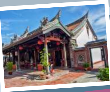
'HARMONY STREET' IN MALACCA, MALAYSIA

The Cheng Hoon Teng temple, Kampung Kling mosque and Sri Poyatha Moorthi temple were built close to each other in the 17th to 18th centuries. 4