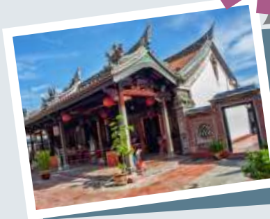
TAI KOK TSUI TEMPLE FAIR IN HONG KONG