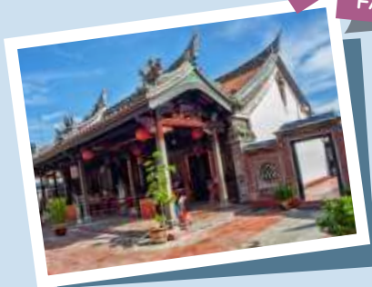
TAI KOK TSUI TEMPLE FAIR IN HONG KONG